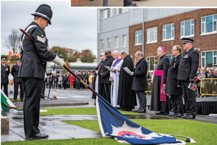
Remembrance Service 2018.