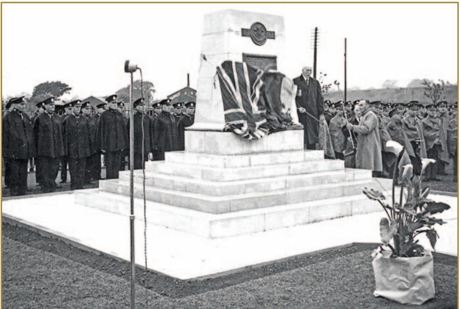
The unveiling of the War Memorial after its removal to Police headquarters, Bridgend.