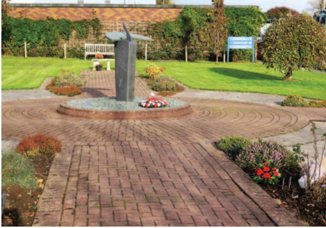
The Sundial and the former Memorial Garden.